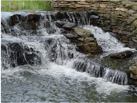
Free Picture: Waterfall; ID: 82808